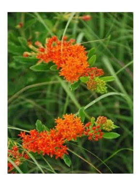
NJ Native Perennial "Butterfly Milkweed" Planted in Waldwick's New Rain Garden

Excessive idling causes an unnecessary release of air contaminants, including air toxics and fine particulates. Every year, hundreds of New Jerseyans die prematurely from exposure to diesel exhaust. Fine particle pollution may cause more deaths in NJ than homicides and car accidents combined.